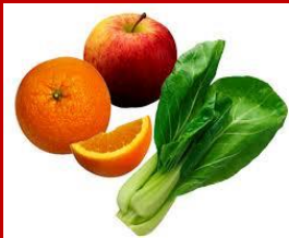
Fruits and Vegetables (remove stickers, bands, ties)