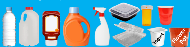
Plastic Coded through

Commingled (Place Curbside— Loose in Bins, NOT in Plastic Bags):