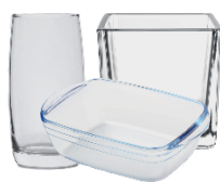
Glass Drinkware, Pyrex, Vases (Donate or Trash)