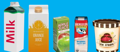
Cartons and Juice Boxes

Include caps and lids. Please empty and rinse items.