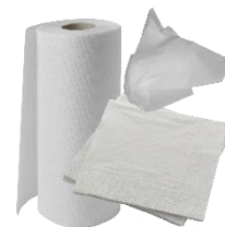
Paper Towels, Napkins, Tissues (Food Scrap Bin or Trash)