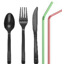
Plastic Utensils, Straws (Trash)