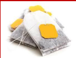
Tea Bags (no staples)