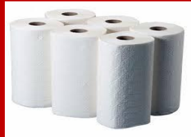
Paper Towels & Napkins