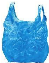
Plastic Bags, Packaging, wrappers, etc.