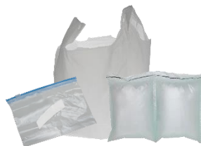
Plastic Bags, Soft Plastic (Store Bin or Trash)

Please consider donating or bringing to a retail store recycling bin where available.