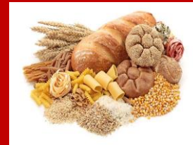
Bread, Pasta, Rice, Grains, Seeds, & Nuts