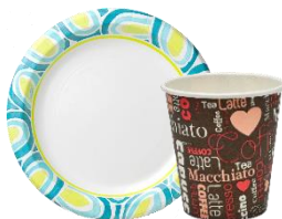
Paper Cups, Plates (Trash)