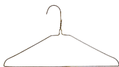
Metal Hangers (Dry cleaners)