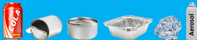
Metal Containers and Foil

Include caps and lids. Please empty and rinse items.