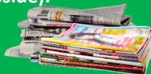
Newspapers, Magazines, Catalogs