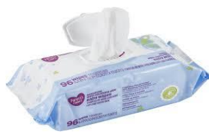
Baby Wipes & Hand Wipes