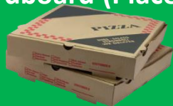
Pizza Boxes (clean)