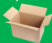
Cardboard (broken down)

* Boxes must be cut and bundled into pieces of not more than 3' Long x 2' Wide