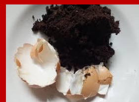
Egg Shells & Coffee Grounds (paper filters OK)