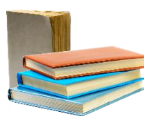
Books (Donate or Trash)