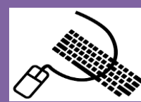
Mice & Keyboards

Textiles can be disposed of in Clothing Drop Box located in the parking lot of Town Hall