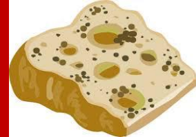
Leftover, Spoiled, and Expired Food (cooked OK)