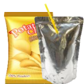
Snack Bags, Food Pouches (Trash)