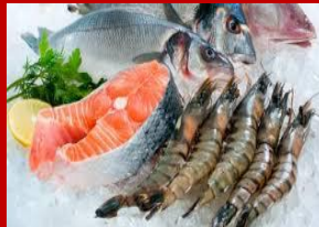
Fish and Shellfish (shells OK)