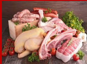
Meat and Poultry (bones OK)